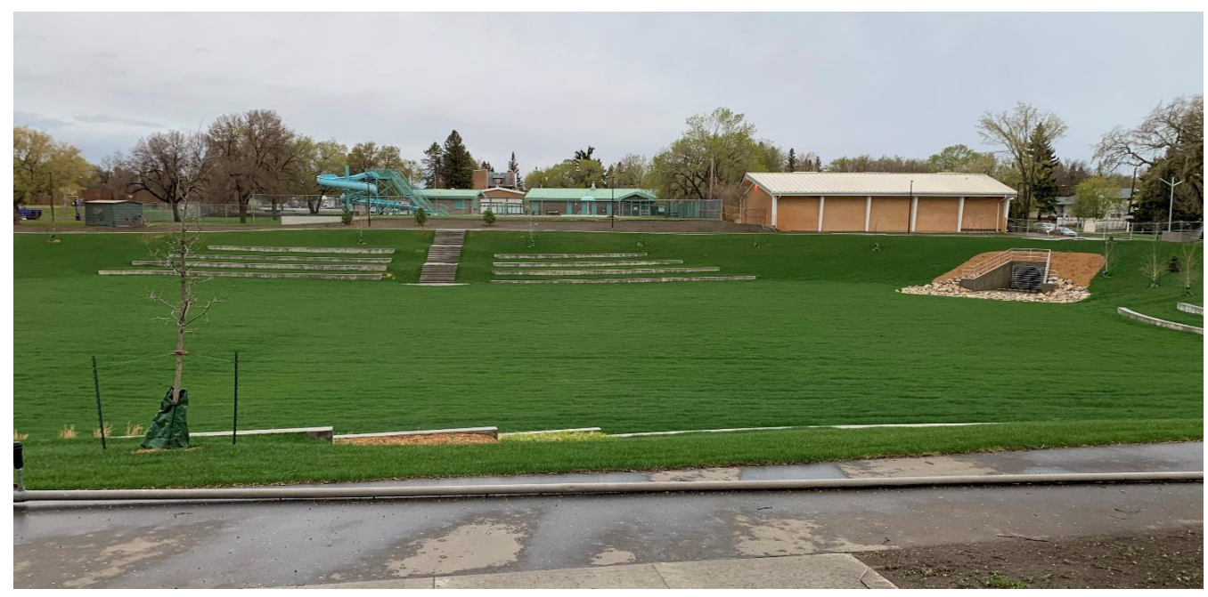
Figure 6: WW Ashley Park - Saskatoon - Completed - May 19, 2022