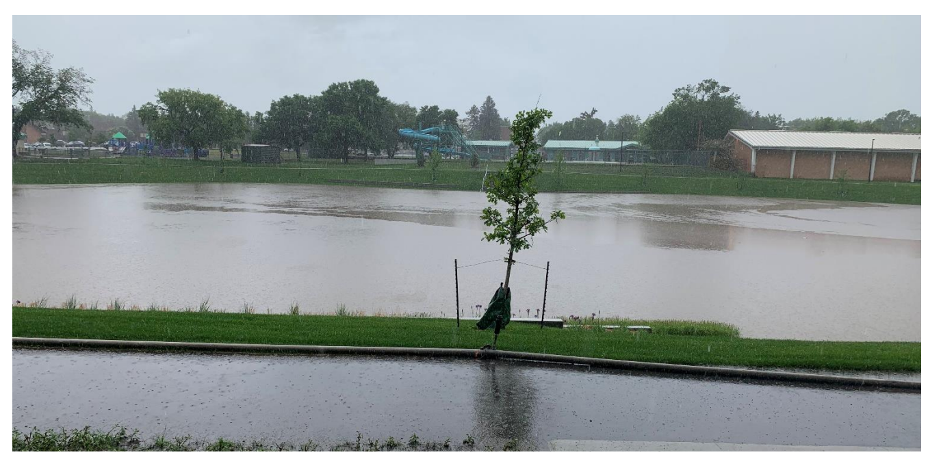
Figure 9: WW Ashley Park - Saskatoon - June 20, 2022 Storm