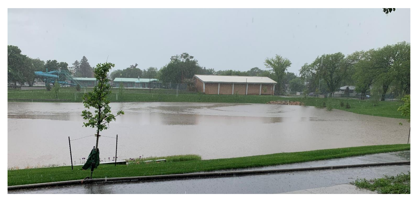
Figure 8: WW Ashley Park - Saskatoon - June 20, 2022 Storm