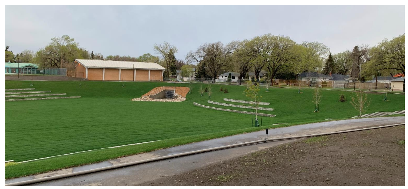
Figure 5: WW Ashley Park - Saskatoon - Completed - May 19, 2022