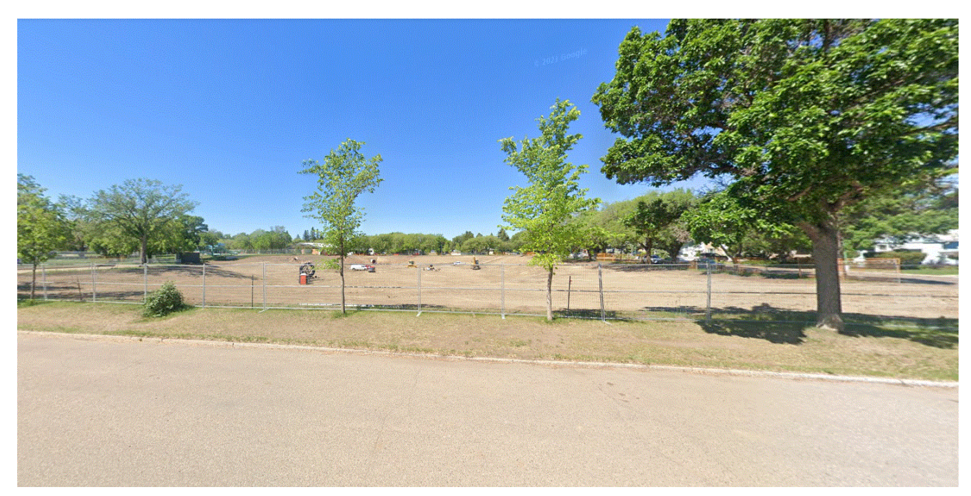
Figure 4: WW Ashley Park - Saskatoon - During Dry Pond Construction - 2021 - Google Street View