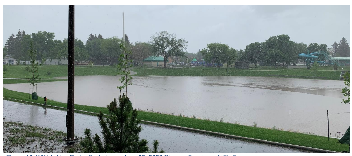
Figure 10: WW Ashley Park - Saskatoon - June 20, 2022 Storm