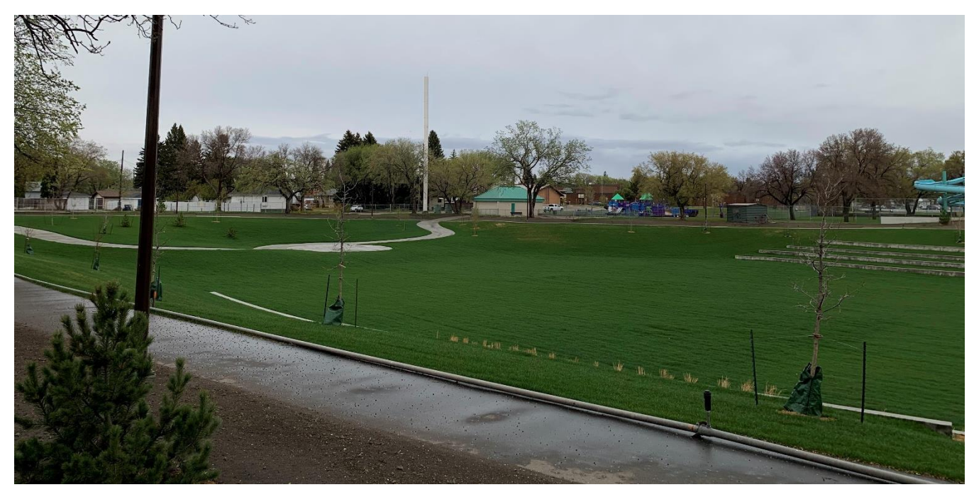
Figure 7: WW Ashley Park - Saskatoon - Completed - May 19, 2022