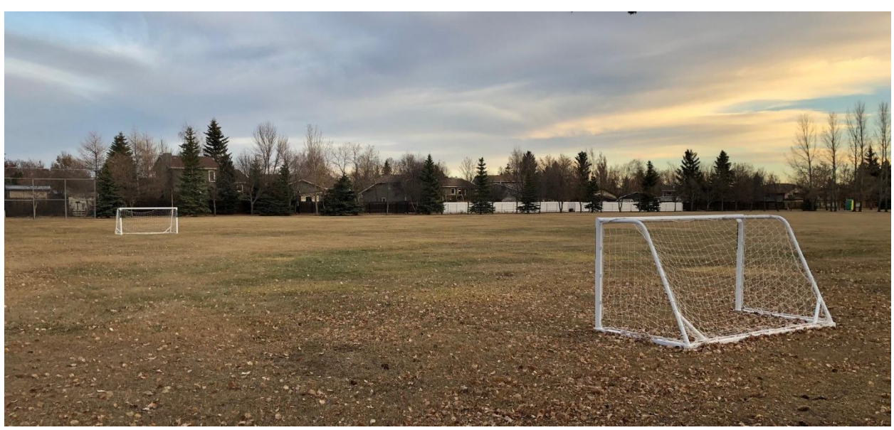
Figure 1: Carl Schenn Park - Humboldt